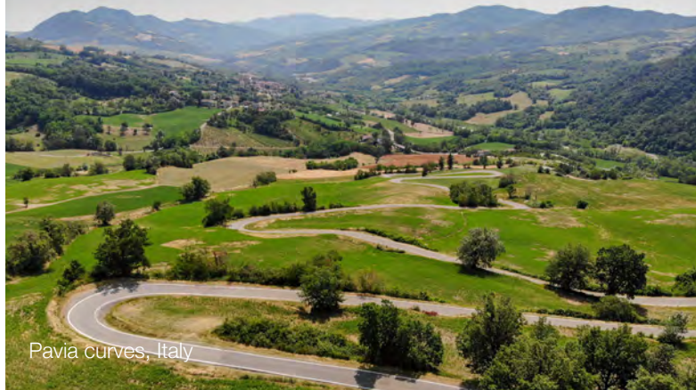
Pavia curves, Italy

Your guides are English speaking Aussies that speak just enough Italian and French to order you a vino at the end of the day or an espresso to get you fired up in the morning!