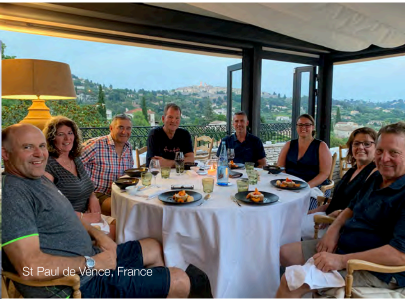
St Paul de Vence, France