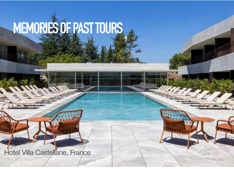
Hotel Villa Castellane, France