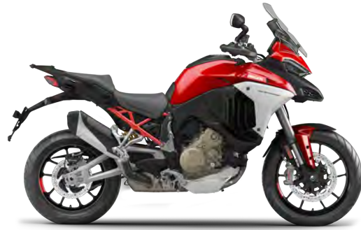
Ducati Multistrada V4