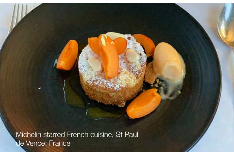
Michelin starred French cuisine, St Paul de Vence, France

So, basically we don't recommend this ride for inexperienced riders. You should have several years riding experience along with your passenger (if you bring one) being comfortable with endless twists and turns.