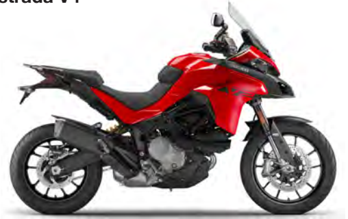
Ducati Multistrada V2