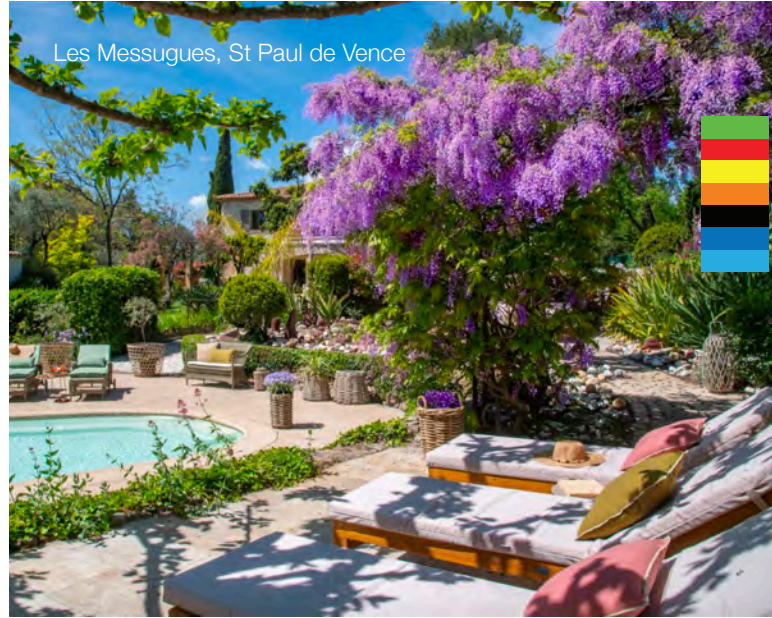
Les Messugues, St Paul de Vence