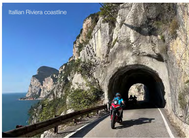
Italian Riviera coastline