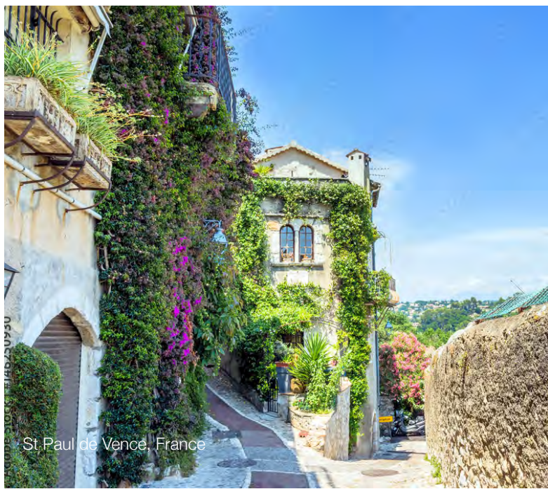
St Paul de Vence, France

PLEASE NOTE: We have prepared pricing in Euros. Please refer to payment information for details.