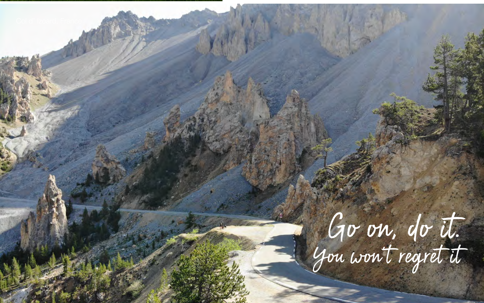
Col d'Izard, France

Tour price includes the rental of a Ducati or BMW adventure bike as listed below including hard luggage cases. A range of Ducati and BMW models are available to choose. If the model you prefer isn't listed here, please contact us and we will organise it for you (pending availability). We can also arrange