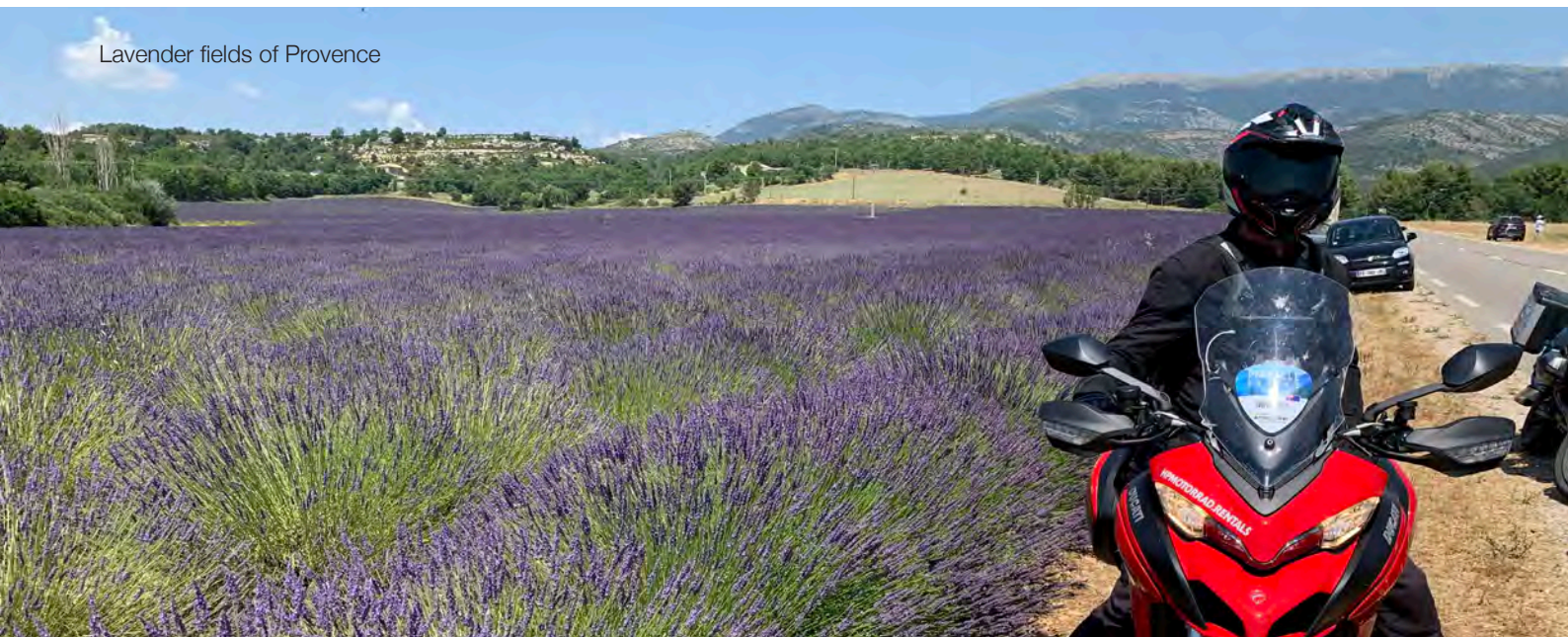
Lavender fields of Provence

This is a small group ride, and pillions are most welcome. As we are travelling through multiple alpine passes, the riding will be challenging in places with many extreme twisty hairpins and some longer days in the saddle. However this will be mixed up