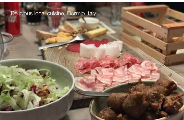
Delicious local cuisine, Bormio Italy

If you like a little bit of luxury in your life then you will love the accommodation we present you with on our tours. Typically at least 4 stars, each property is carefully selected to wow you in some way; whether its location, views, food or just straight up