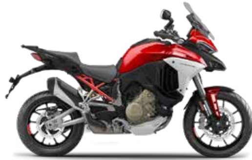
Ducati Multistrada V4

If you require additional nights accommodation either pre or post tour at our hotels we are happy to arrange that.