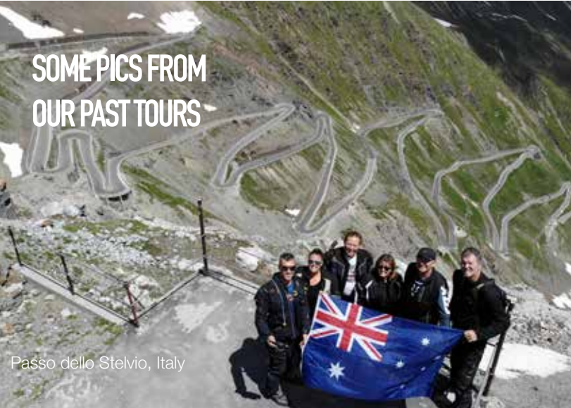
Passo dello Stelvio, Italy