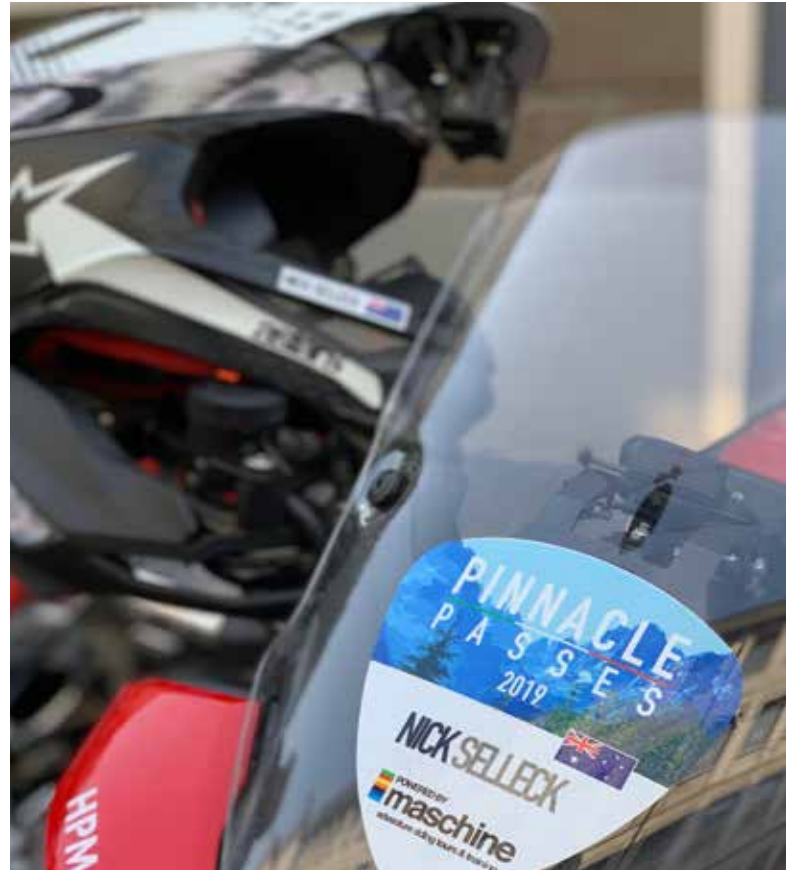
Lake Como, Italy

All major banks have the facility in their internet banking to enable you to do this and is very simple to do. We can assist with this process should you need it.