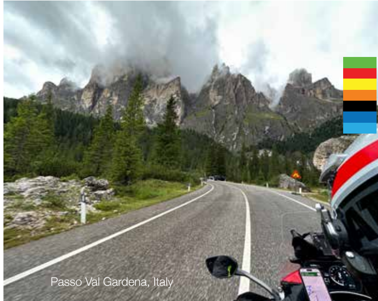
Passo Val Gardena, Italy