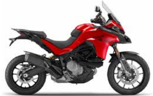
Ducati Multistrada V2